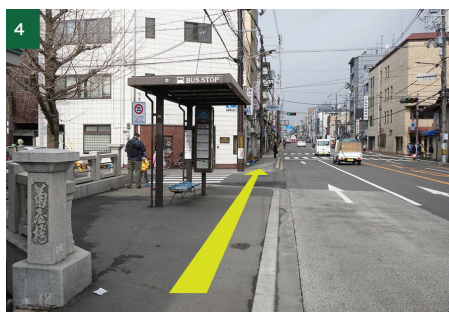
Cross the bridge of Shirakawa River and go past Chion-in bus stop.