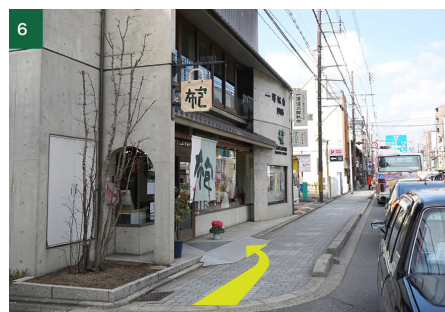
You will see our shop sign "帆布" over a large glass window on your left.