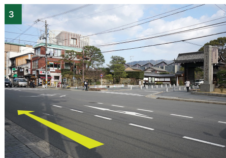
Continue across the street past the second set of lights; the gate of Chion-in Temple is on your right.