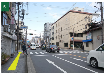
Continue straight on.