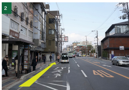
Go past Gion bus stop and continue straight.