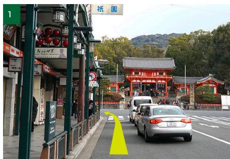
Face Yasaka Shrine's main entrance and turn left.

With Yasaka Shrine on your right, go straight past three traffic lights. Our shop is the one with the large glass window and our shop sign "帆布".